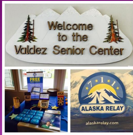
Our team went to Valdez Senior Center to educate about CapTel.