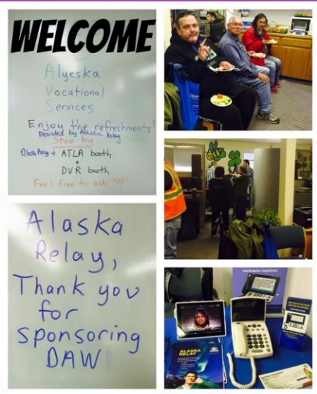
We sponsored the Bridges Navigator Program Open House.