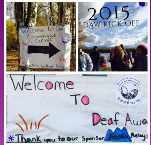
We worked with Alaska State School for the Deaf and Hard of Hearing to sponsor the Deaf Awareness Week Kick-Off Event.