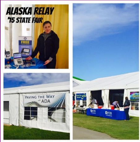
We exhibited our services at the "Paving the Way for ADA" event.